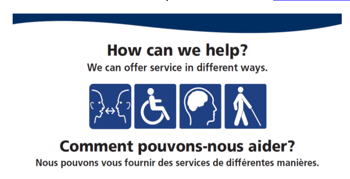
Fig 1. Bilingual sign with disability icons, which asks: How can we help? We can offer service in different ways.

For more information, please visit the <u>Accessibility Manitoba website</u>: