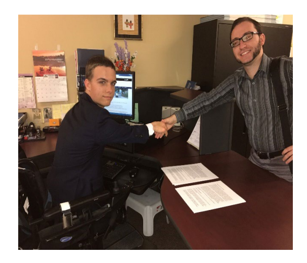
Figure 4. Accessible employment

• Description of Figure 4. Accessible employment. A worker with a wheelchair shakes hands with a client over a desk in the workplace.